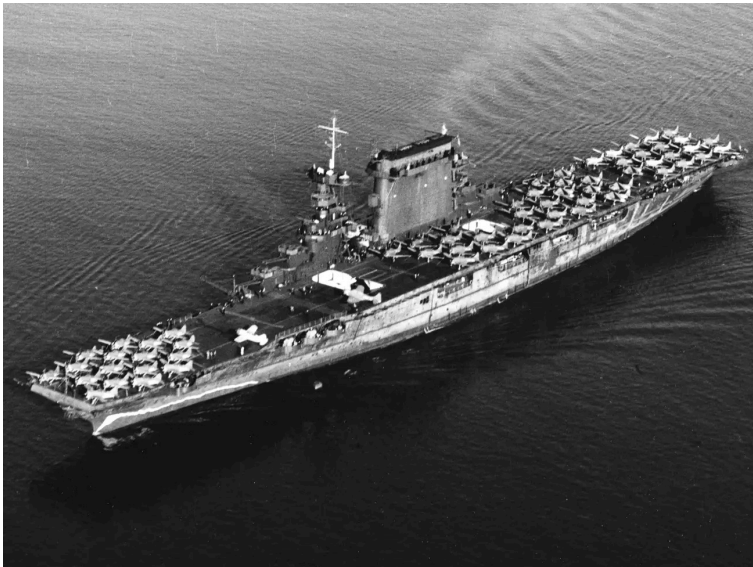
USS Lexington (CV-2)

On December 5th, 1941 the USS Lexington departed Pearl Harbor on a special mission to deliver 18 planes to Midway Islands . Accompanying her was the typical 'carrier escort fleet' of several cruisers, destroyers, supply ships and the USS Wright .