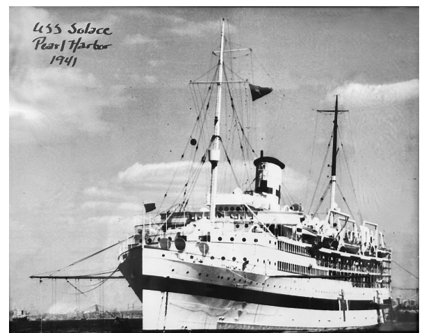
USS Solace (AH-5)

Finally the curtain parted and a doctor holding a slender wooden stick with a thin, wire loop at one end, stepped in front of him. "Open your mouth!"